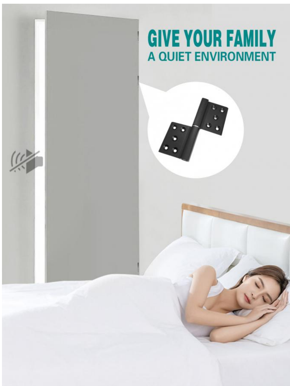
Installation suggestion diagram